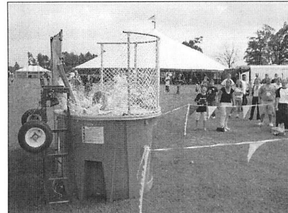
Move towards the front of the tank when coming up out of the water to avoid hitting head on the seat.