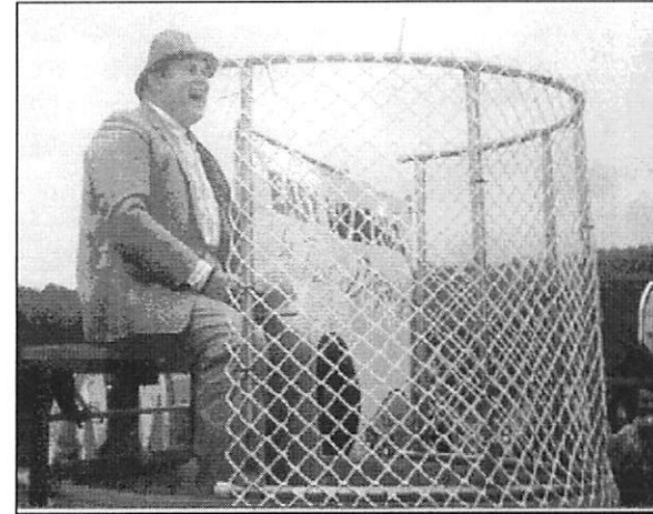
Wear shoes, keep hands on knees, and sit forward.